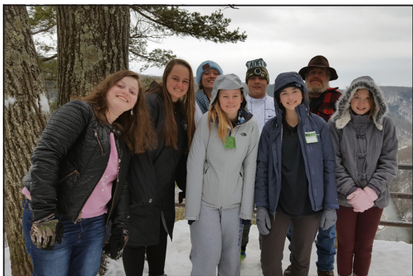
Above: Ski Weekend

SATURDAY, SEPTEMBER 12, 2020 6TH ANNUAL BREAKFAST BANQUET