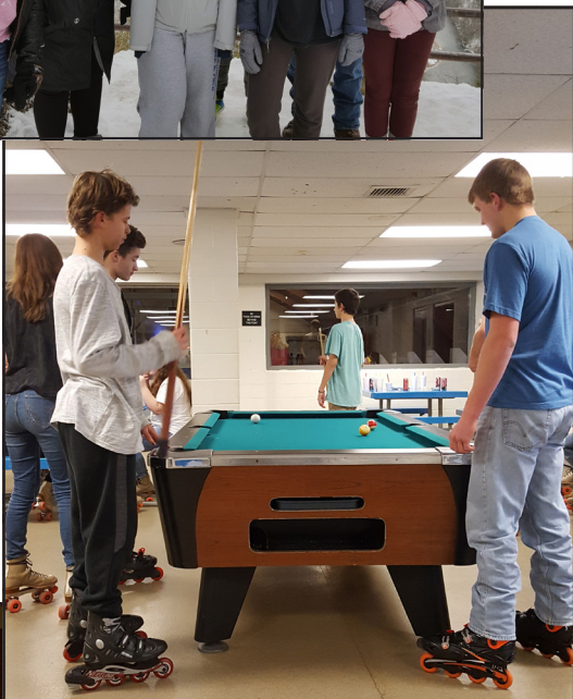
Right & Below: Roller Skating at Overlook