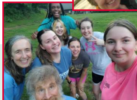
Grad. and End of Summer Night